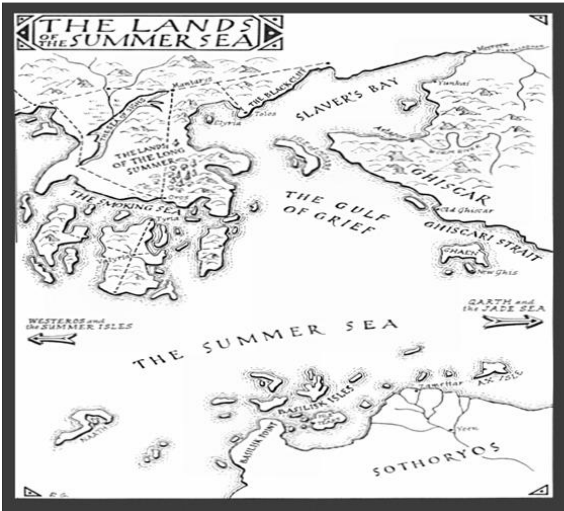
Map (The Land Beyond the Wall)